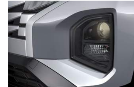
Halogen Projection Headlamps