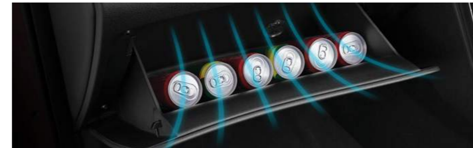
Cooling Glove Box