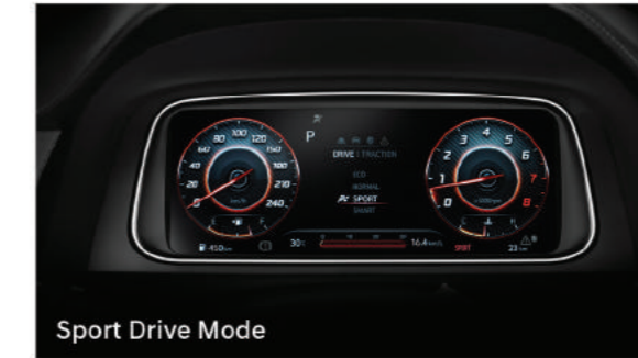
Sport Drive Mode