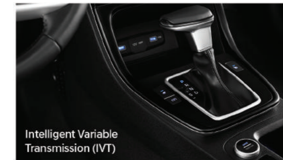
Intelligent Variable Transmission (IVT)