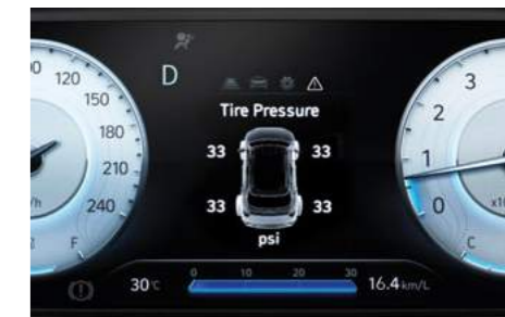
TPMS (Tire Pressure Monitoring System)