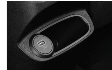
Rear USB Charging Port