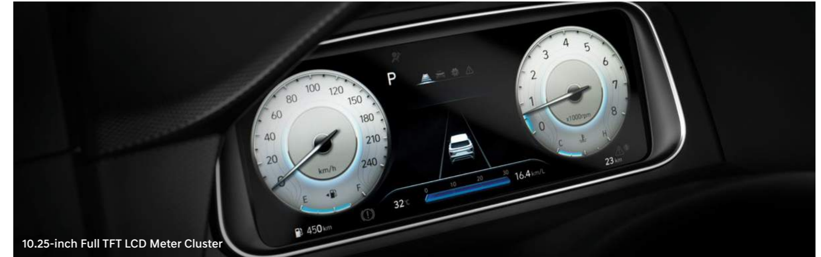
10.25-inch Full TFT LCD Meter Cluster