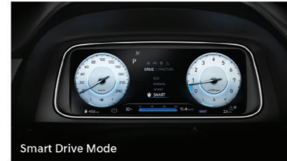
Smart Drive Mode