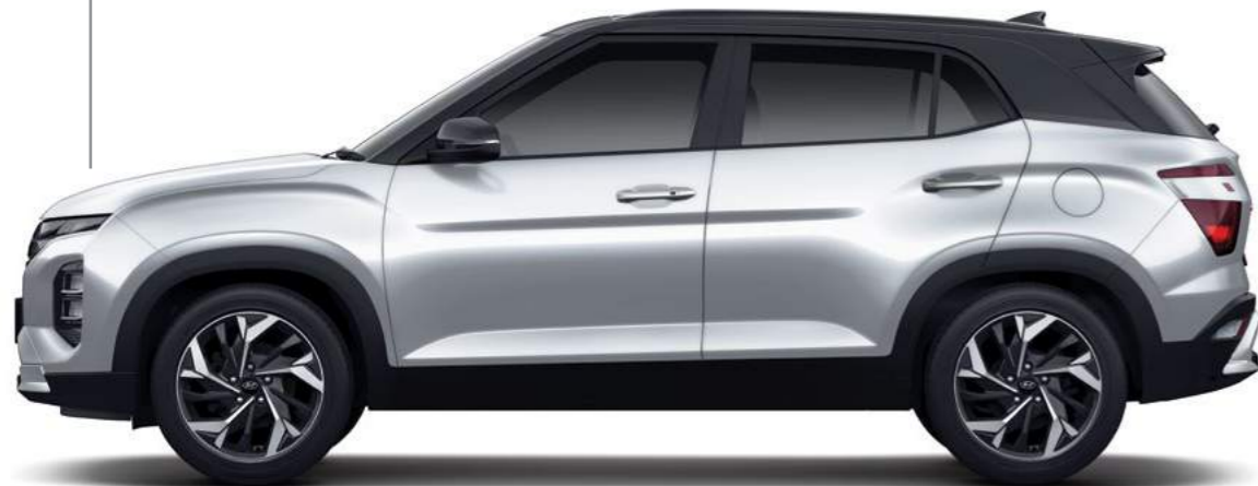
17-inch Alloy Wheels