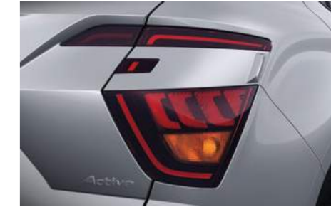
LED Rear Tube Lamp