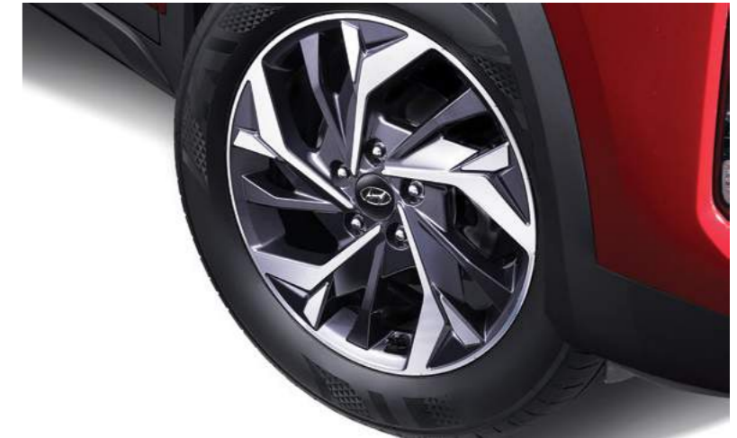
17-inch Diamond Cut Alloy Wheels