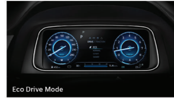
Eco Drive Mode