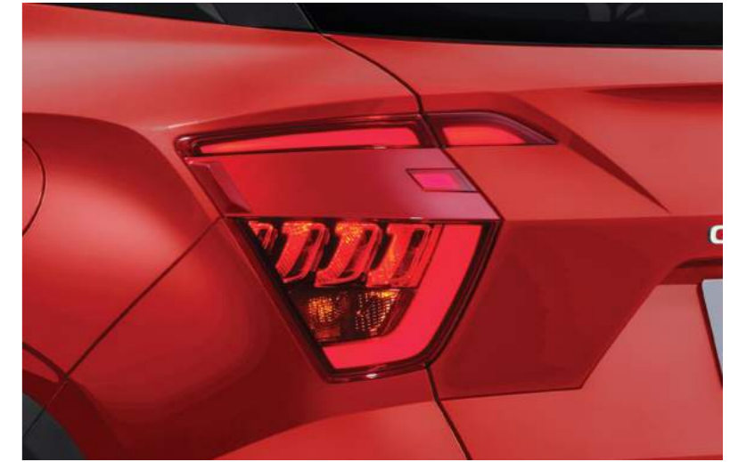
LED Rear Combination Lamp