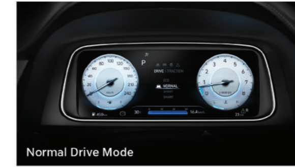
Normal Drive Mode