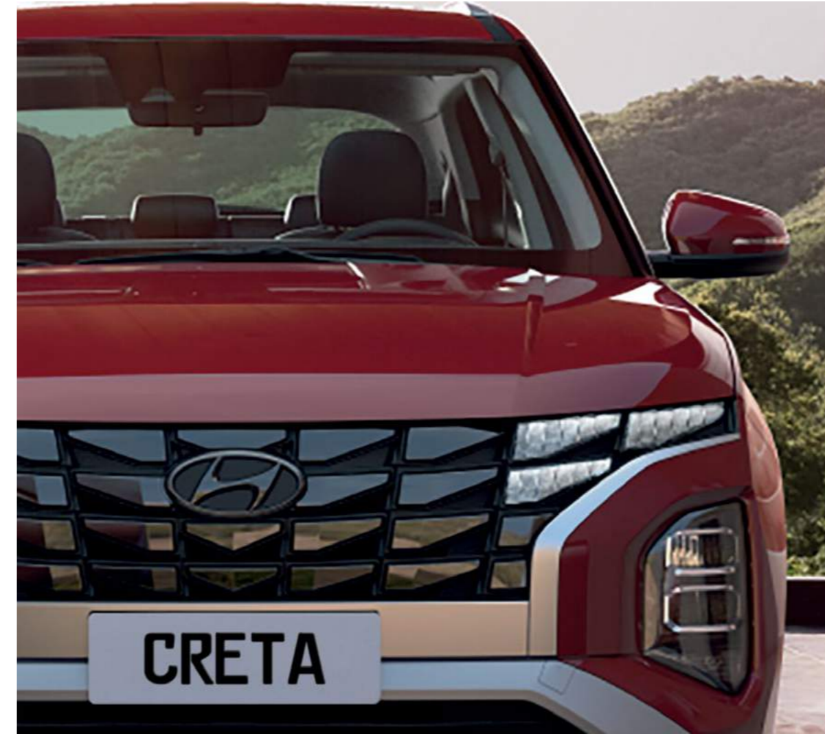
Parametric Jewel Pattern Grille & Hidden-type LED DRL