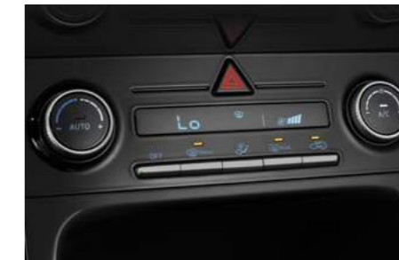
Full Automatic Temperature Controls