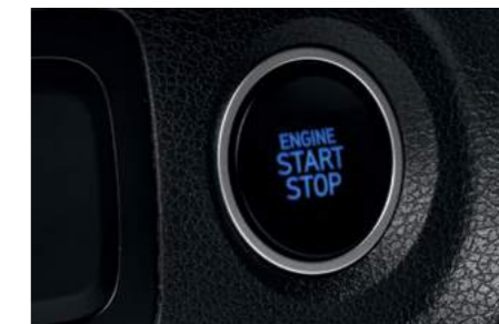
Push Start Button