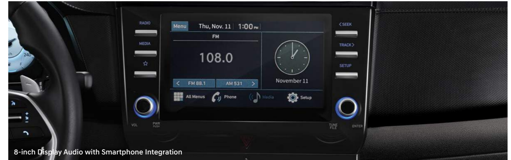
8-inch Display Audio with Smartphone Integration