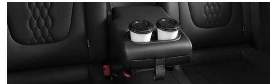
Rear Center Armrest with Cup Holders