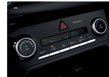
Full automatic temperature controls