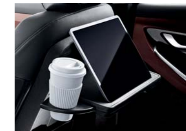
Front row seatback table with retractable cup-holder and IT device holder