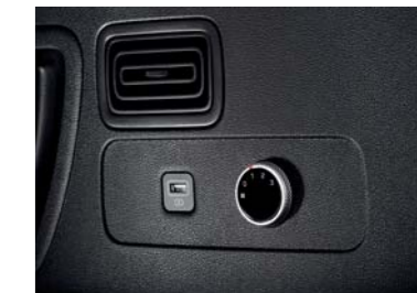
3rd-row AC vents with 3-speed fan control