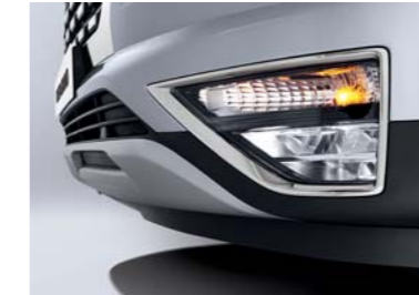
Front fog lamps (LED MFR)