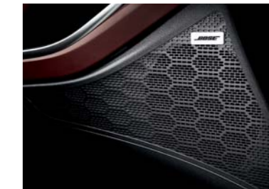
BOSE premium sound system