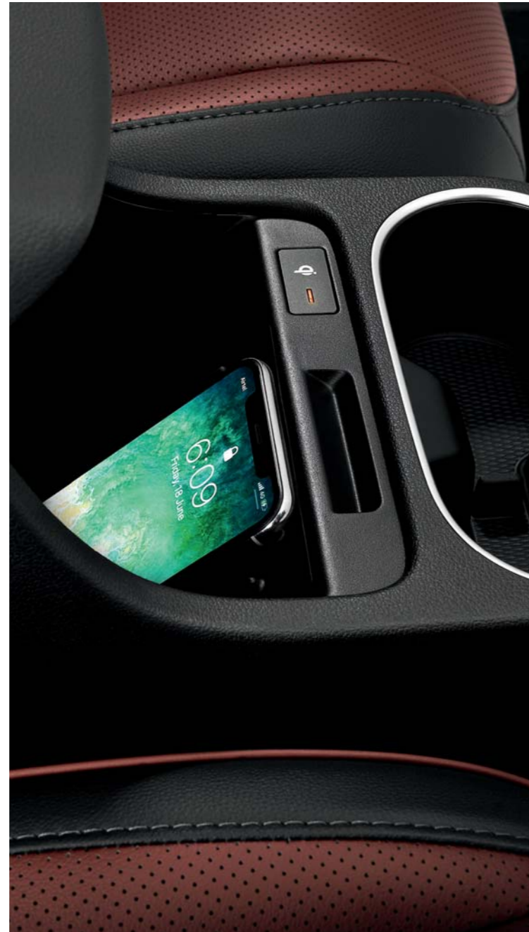
2nd row wireless phone charger