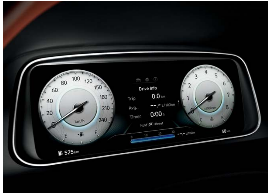
10.25" TFT LCD cluster