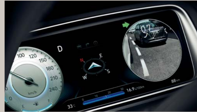
Blind-Spot View Monitor (BVM) When the turn signals are activated, the rear-side image of the corresponding direction is displayed in the cluster.