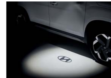
Puddle lamp with Hyundai logo projection