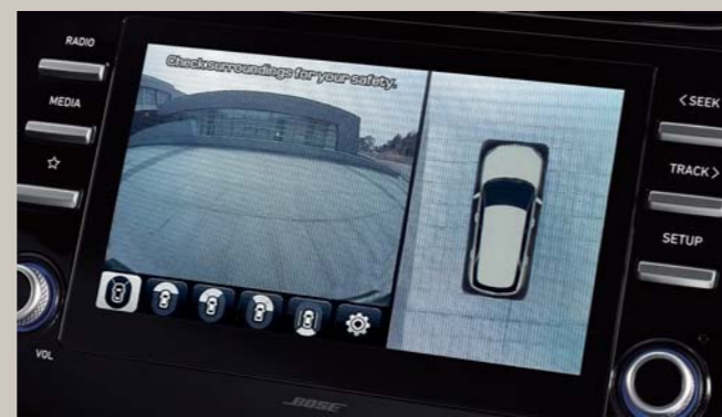
Surround View Monitor (SVM) A multi-camera system provides a 360-degree view around the vehicle to assist the driver in parking situations.