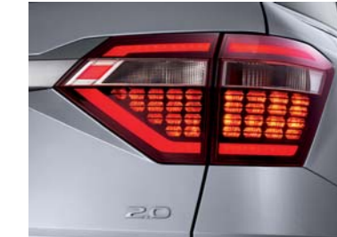
LED rear combination lamp