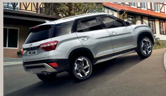
Hillstart Assist Control When starting from a stop on a hill, HAC prevents the unintentional rollback that can occur after the brake pedal is released.