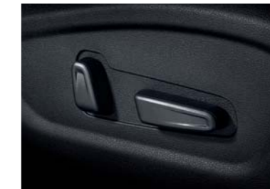
Driver's 8-way power seat