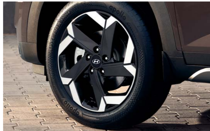
LED headlamps with LED DRLs 18" diamond-cut alloy wheels