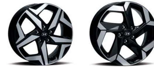
17" Alloy wheels 18" Alloy wheels