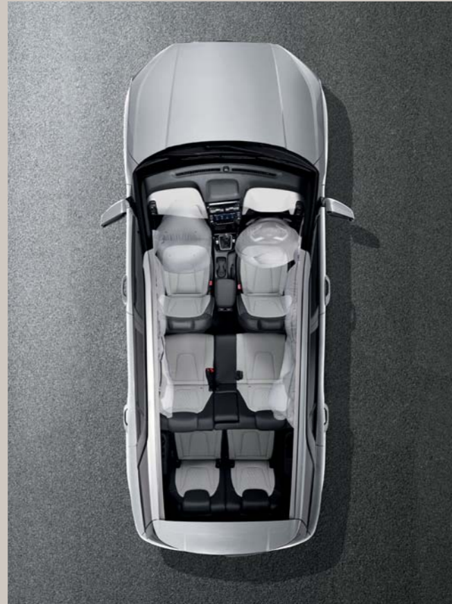
6-airbag system (Driver, Passenger, Side & Curtain) CRETA GRAND offers 6 airbags: the driver and front passenger get a pair of front airbags plus a pair of side airbags to protect the thorax and pelvic areas while left and right curtain airbags offer head protection for all cabin occupants.