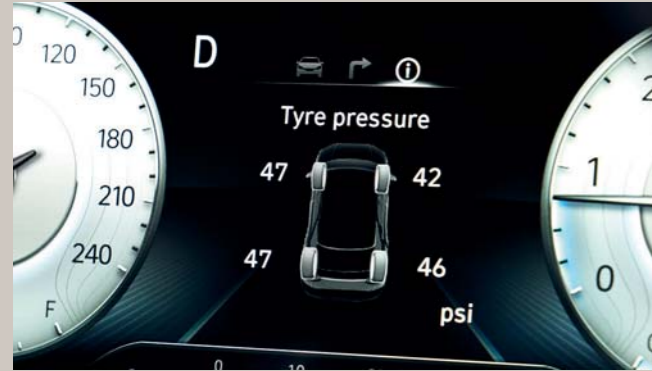
Tyre Pressure Monitor System (TPMS) TPMS helps you achieve optimal fuel economy and extends tire life by alerting you if the tires require attention.

Though the road ahead is filled with uncertainties, CRETA GRAND's advanced safety systems provide you with complete peace of mind. Special crush zones serve as your first line of defense. Made of ultra-high tensile strength steel and embedded in critical areas, these structures are designed to safely absorb impact forces and protect cabin occupants in the event of a collision. The Blind Spot View Monitor always looks over your shoulder and will alert you if you try to make an unsafe lane change.