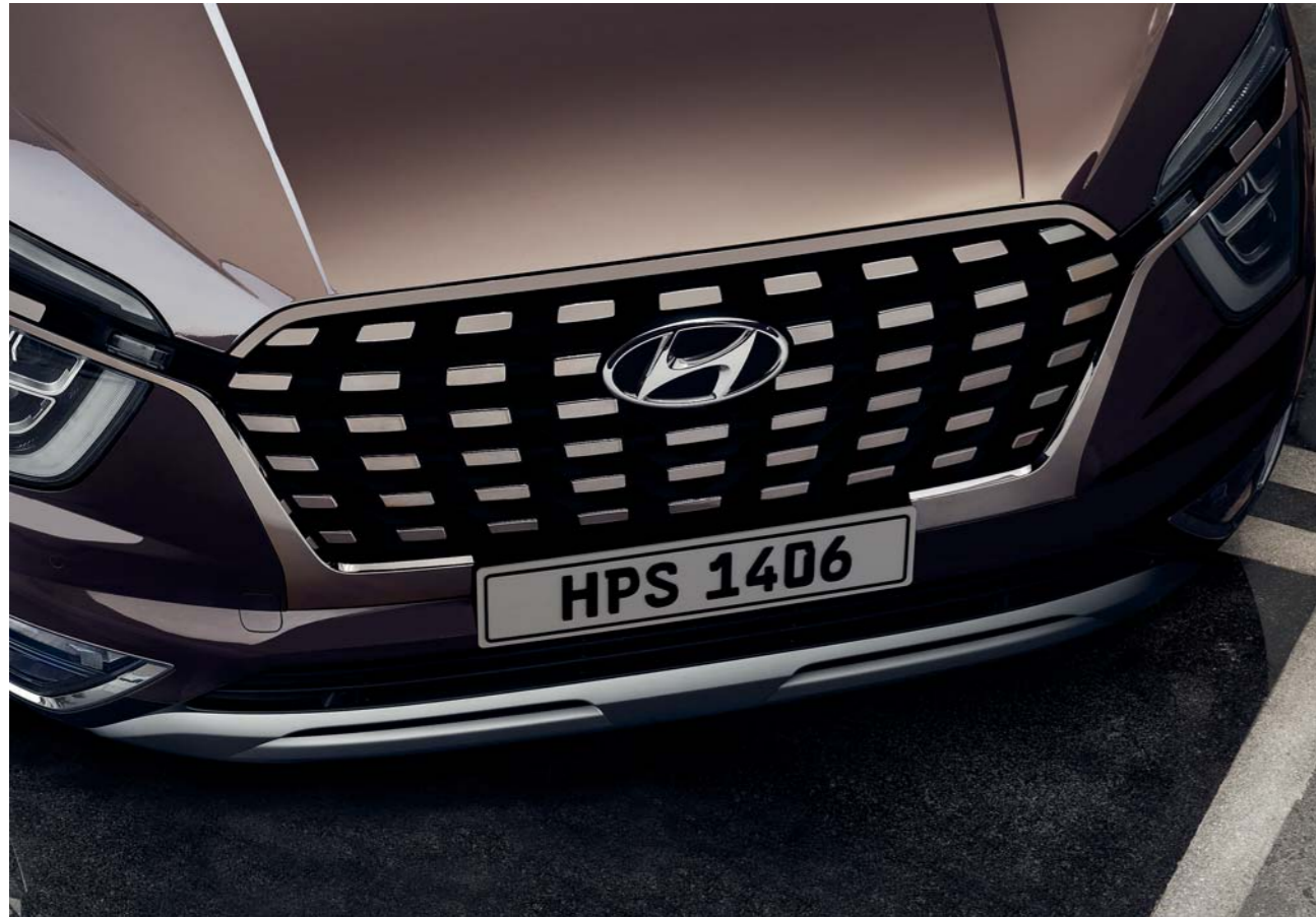
Signature cascading grille with dark chrome finish

Modern, sporty, and masculine—it's just my style, it's in perfect tune with my sensibilities, and it fits in anywhere. From any angle, CRETA GRAND projects supreme confidence and authority. Your fascination only grows as you move in closer to examine the details: The LED lighting, the strikingly-designed diamond-cut alloy wheels, and the catchy-looking radiator grille. But the real centre of attention and even greater delights await you inside.