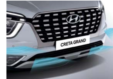
Front distance warning