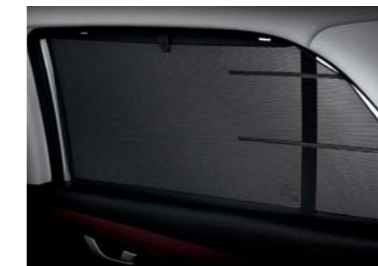
Rear door manual curtain