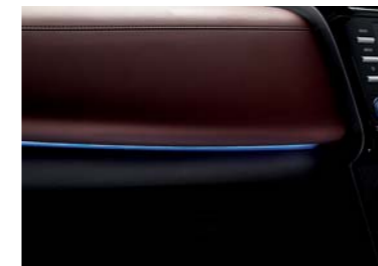
64-Color ambient mood lamp