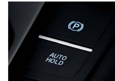
Electric Parking Brake with Auto Hold