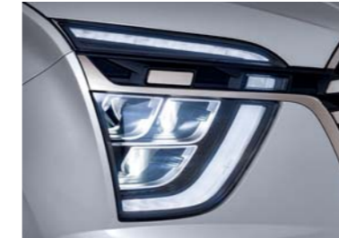
LED MFR headlamps & LED DRLs