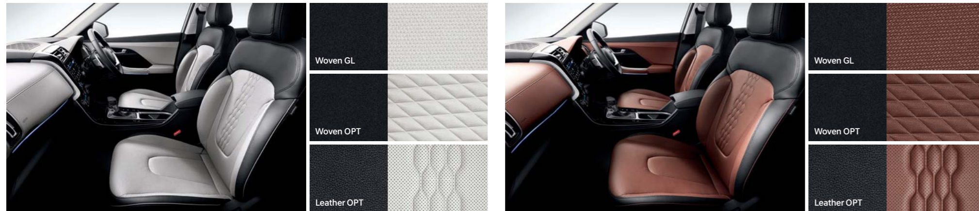
Black / Gray two-tone interior