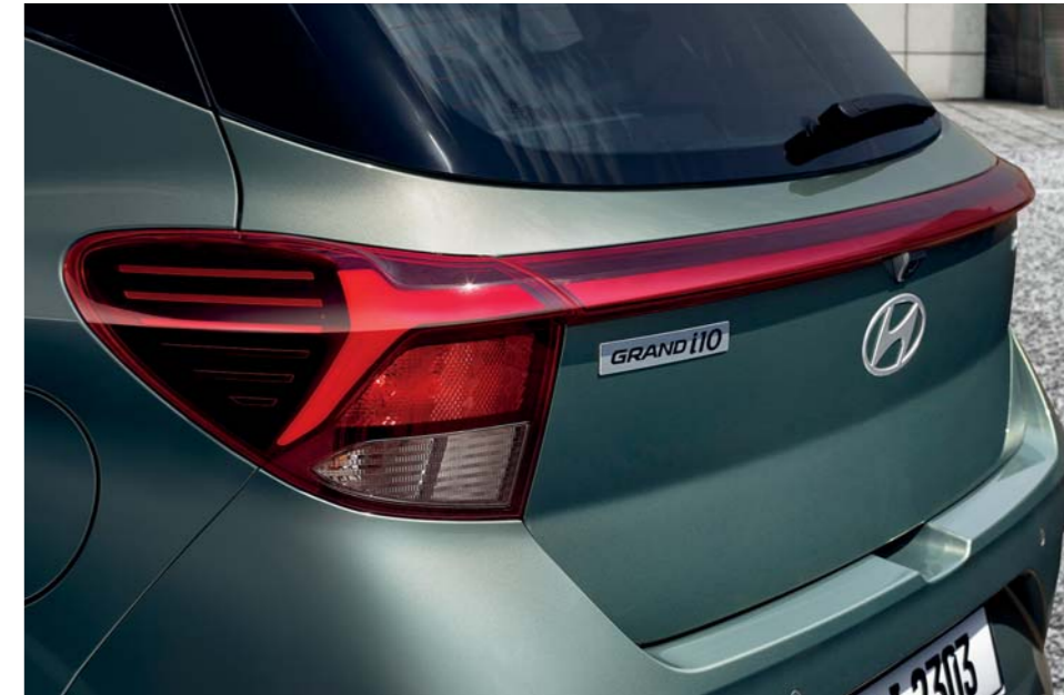
LED tail lamps

Grand i10 gets you started on your next road adventure in bold, exciting style. Every details amplifies the driving fun factor. It sports edgy-looking 15-in alloy rims, and a larger, bolder glossy black radiator grille that commands instant attention. LED-lights add a note of high-tech sophistication while the two-tone paint treatment creates a distinctively modern appearance.