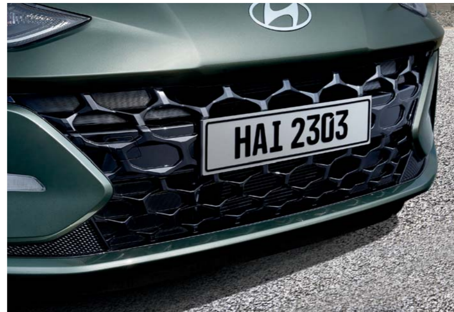
Glossy black radiator grille