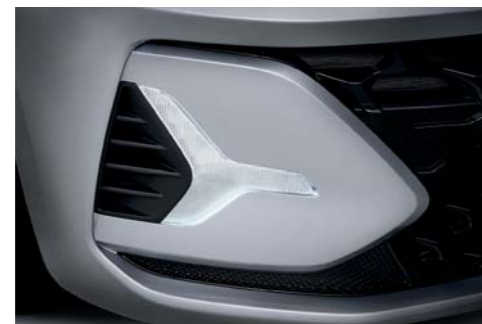
LED Daytime Running Lights (DRL)