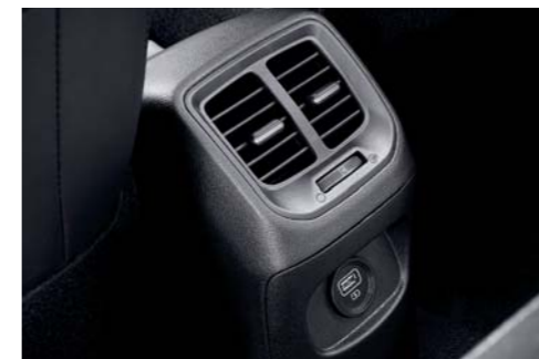
Rear AC vents