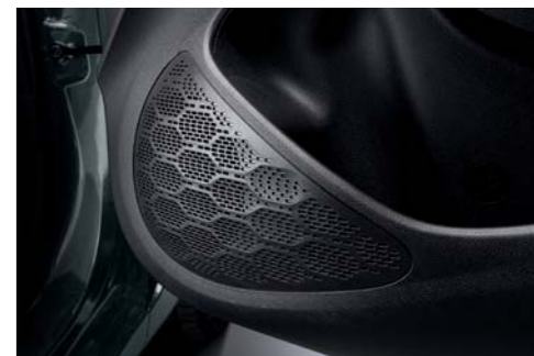
Front / Rear four-speaker system