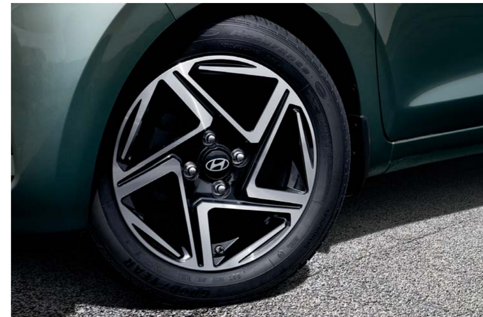
15" alloy wheels