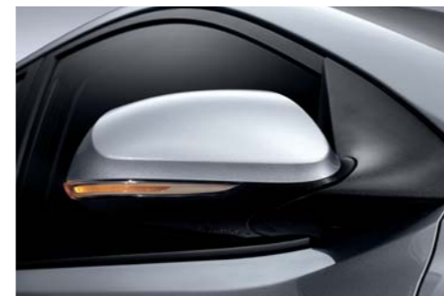
Outside mirrors & repeaters