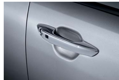
Chrome-coated door handles