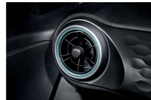
Unique propeller-style AC vents