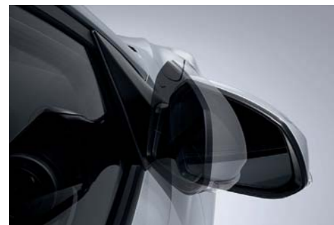
Electric folding mirrors