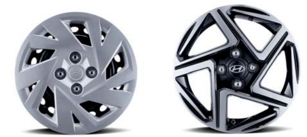
14" Steel wheel cover