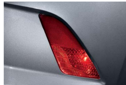
Rear fog lamps