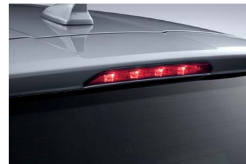
LED high-mounted stop lamp