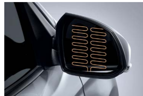
Heated side mirrors