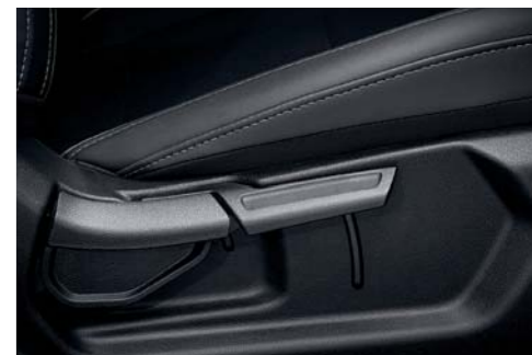
Driver seat height adjuster