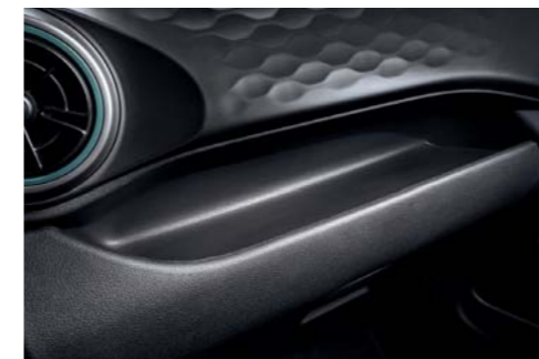
Practical storage area