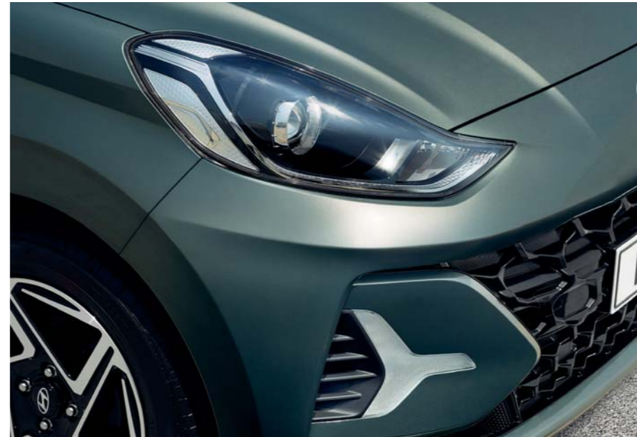
Projection headlamps / LED Daytime Running Lights (DRL)