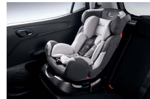
ISOFIX child seat anchor system